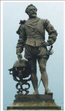
Statue of Drake

Joseph Boehm's statue of Sir Francis Drake, unveiled in 1883, stands close to the route of the Drake's Trail. A copy of the statue stands at the other end of the Trail, on Plymouth Hoe. Drake's former home, Buckland Abbey, houses a plaster cast of the statue.